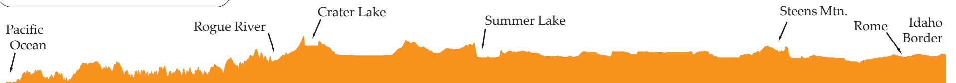
West to East (Southern Oregon)