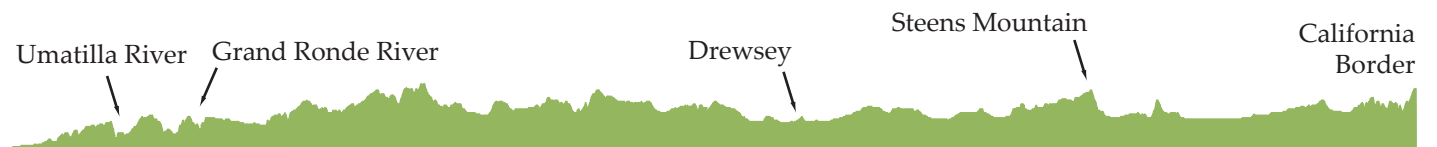
North to South (Eastern Oregon)

Because elevation changes are small compared to the horizontal distances, we have exaggerated the vertical scale (height) to better show the variation in the elevations.