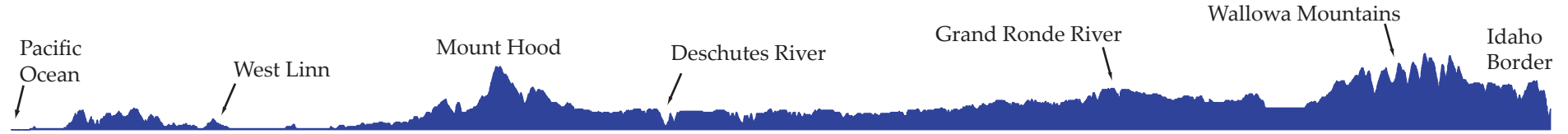
West to East (Northern Oregon)

These cross sections show differences in elevation in Oregon. For example, if you follow the blue line (Northern Oregon) from the west to the east you can see that the elevation is at sea level at the Pacific Coast, but is high at Mt. Hood and the Wallowa Mountains.